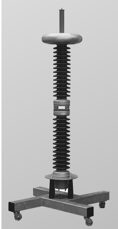
700 kV, 500 pF divider