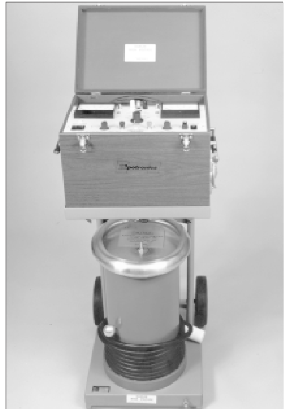
Model 100 HVT AC Hipot Tester

A triple range current meter enables low current readings of 0 to 1/10/100 mA on the 100 HVT. A triple range voltmeter is connected directly across the output for maximum accuracy. The 100 HVT has a 50 kV tap that is used for bucket liner testing and other low voltage, high current test requirements.