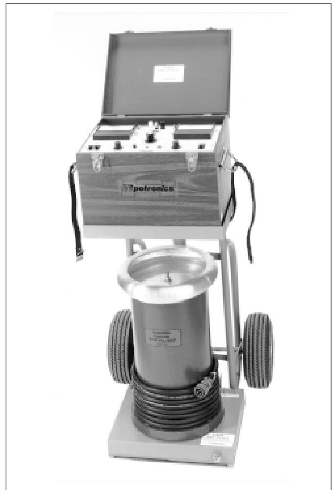
Model 120 HVT AC Hipot Tester