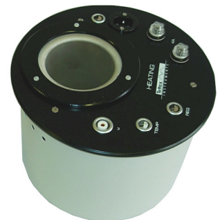
Heating pot 2903