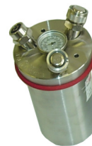
Test cell 2903a